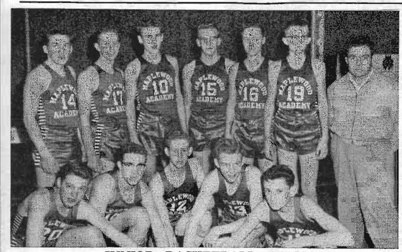
JUNIOR BASKETBALL TEAM